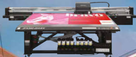
Mimaki JFX200-2513 EX